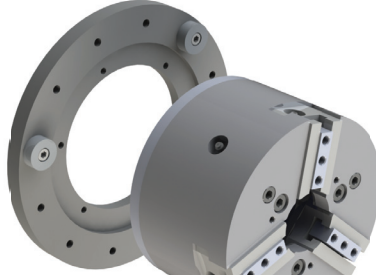
fixed position method